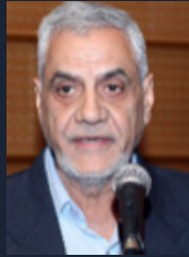
PADMA SHRI M.C. MEHTA ADVOCATE, SUPREME COURT OF INDIA