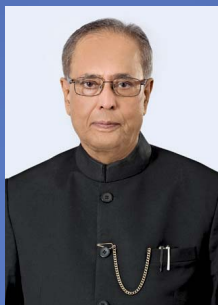
Hon'ble Shri Pranab Mukherjee Former President of India