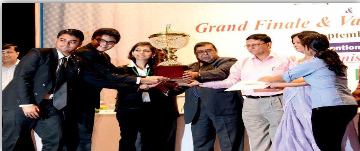
The 5 th KIIT National Moot Court Competition, 2017

Before a panel of eminent judges like Justice Altamas Kabir, Former Chief Justice of India, Justice Pinaki Chandra Ghose, Judge, Supreme Court of India and other Justices of the Orissa and Calcutta High Court, the grand finale witnessed some intense advocacy by Hidayatullah National Law University, Raipur and Rajiv Gandhi National University of Law, Patiala, pleading on behalf of petitioner and respondent respectively and the success of that event encouraged us to conduct the 3 rd Edition.