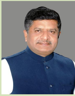
Hon'ble Minister Law & Justice Shri Ravi Shankar Prasad