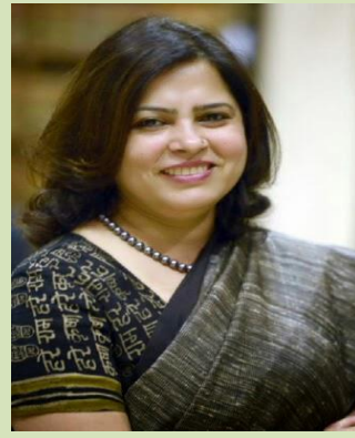
Ms. Meenakshi Lekhi MP & National Spokesperson, BJP